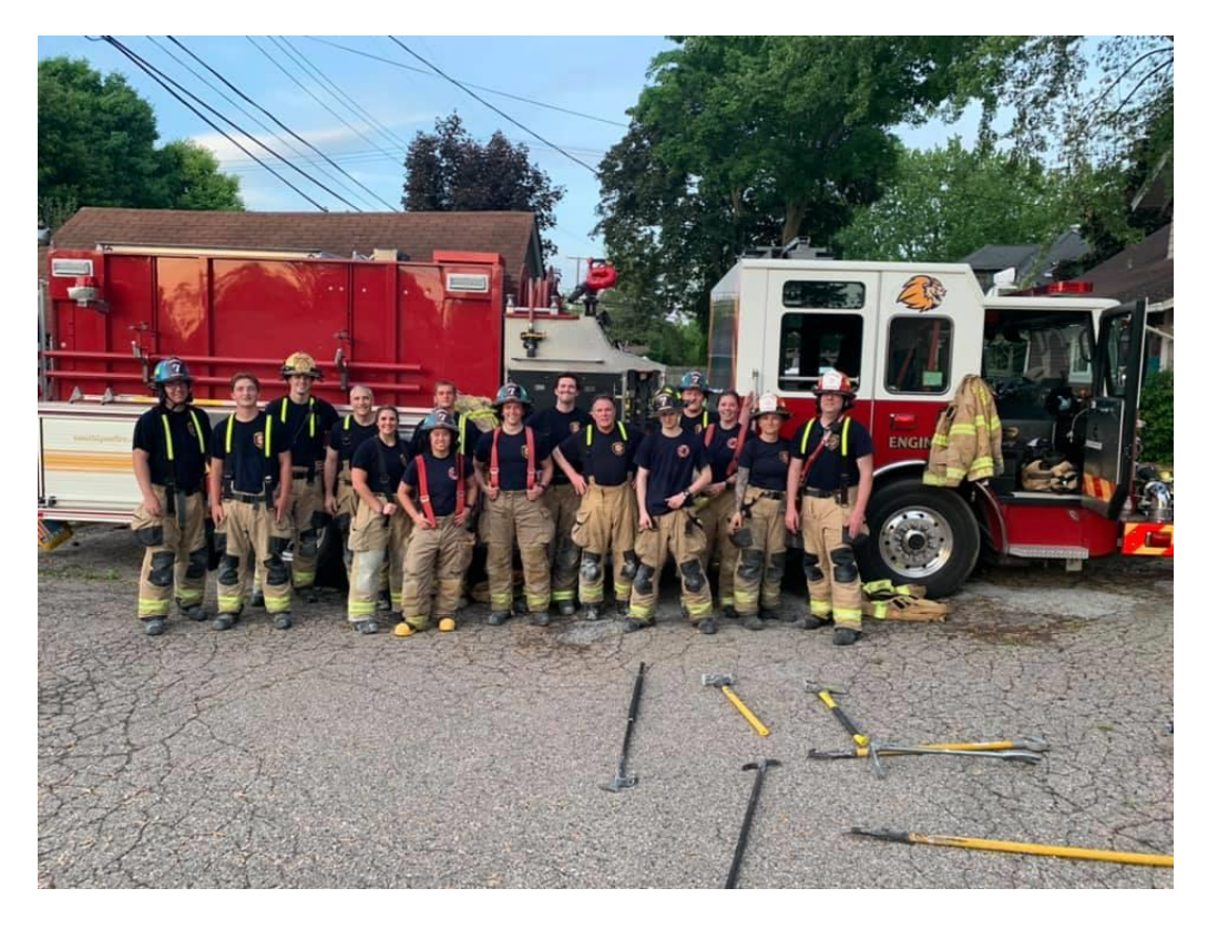
West Lake street training SL Rec Building Spring 2020