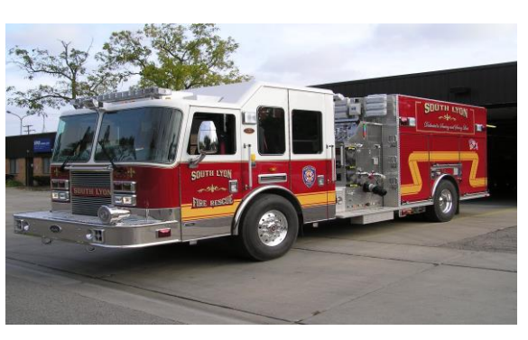
Engine 2 – 2008 KME Predator