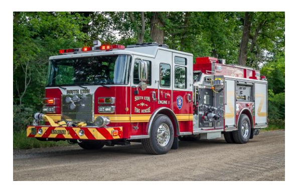
Engine 1 - 2016 Pierce Sabre

The Department's vehicle fleet includes many differing vehicles to help protect the City of South Lyon from a variety of incidents and emergencies. Currently, SLFD's fleet consists of one (1) aerial ladder truck, two (2) fire engines, one (1) rescue vehicle, and two (2) administrative vehicles.