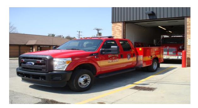
Rescue 1 – 2010 Ford 350