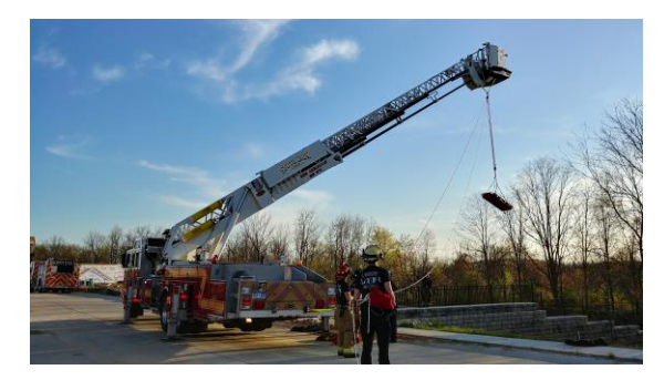
Ladder 1 – 2000 KME Aerial