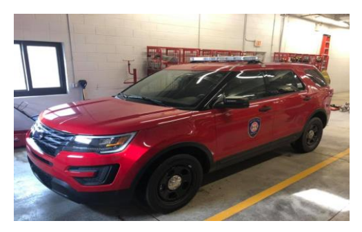
Command vehicle 2019 Ford Interceptor